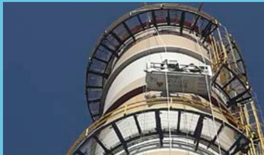
Construction & industries