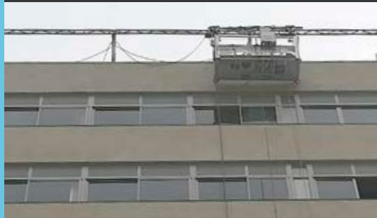
Vertical and horizontal movement